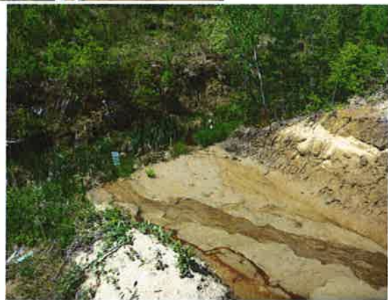
Trench designated for household waste