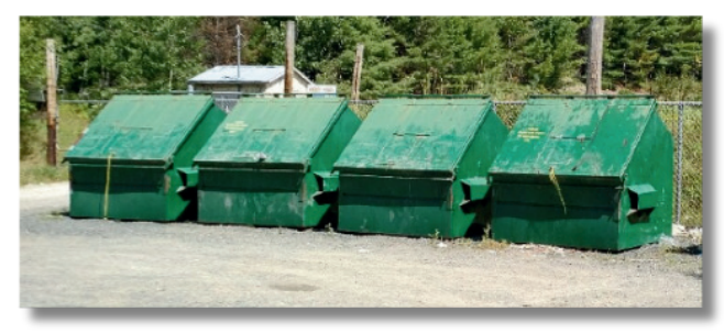
HOW TO AVOID WASTE SITE TIPPING FEES

Starting May 2024, Ward 2 Waste Disposal Site (473 Cullis Rd) will transition from a traditional landfill to a transfer station. This initiative is a key part of our 25-year plan for a greener, more efficient future. Stay updated and #stayinformed at www.huronshores.ca.